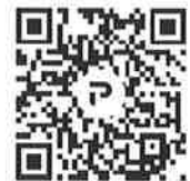
CONCRETE MODEL 6.5