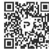
CONCRETE MODEL 2.8/3.4/4.1

SCAN ME TO SEE HOW TO INSTALL OUR PRODUCTS